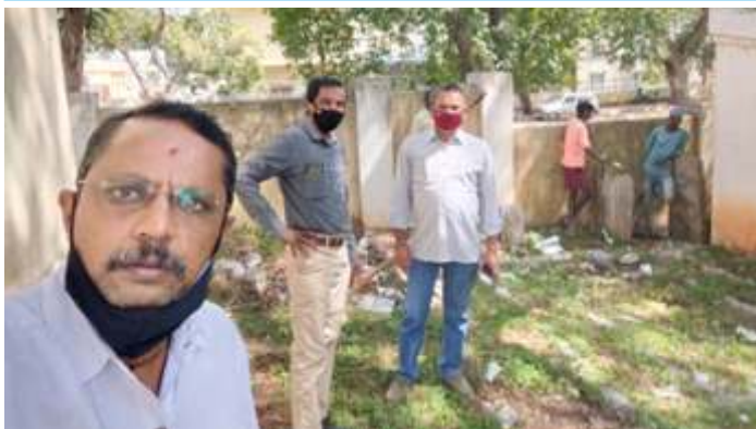
Toilet project under survey at Govt. PU College, Lakshmiपुरam, Mysuru