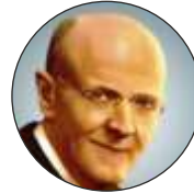
Rtn. Paul Harris Founder

Starting from Wednesday 2nd Dec Every Wednesday 4:30 PM to 5:30 PM - Rotary India Web Team